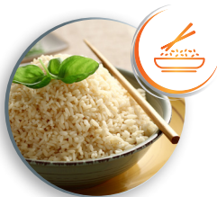
Page 9. Mushroom and Saffron Risotto