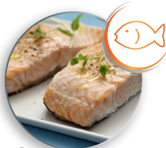
Page 10. Cod with Olives