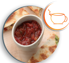
Page 13. Tomato Sauce 14. Bechamel Sauce 14. Meat Sauce 15. Hot strawberry Sauce