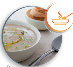
Page 6. Asparagus and Cheese Soup 7. Tomato Soup 8. Mushroom Soup