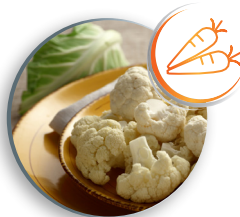
Page 11. Jacket Potatoes 12. Vegetable Ratatouille