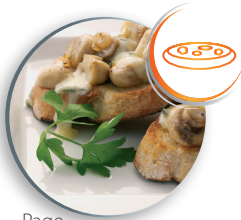
Page 5. Cheese and Mushroom Toast